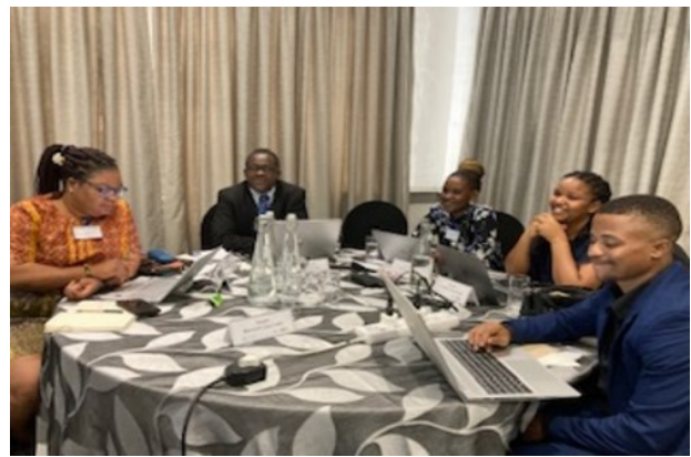
Participants in the workshop on Fiscal Risk Management for Sovereign Guarantees