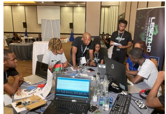
Participants in the Public Financial Management Hackathon in Lesotho

Lesotho: AFS participated in a PFM hackathon organized by FAD and the Ministry of Finance, Lesotho to design a potential digital technology solution to authenticate transactions and documents in the IFMIS. The event that was open to participants from Sub-Saharan Africa received over 600 registrations and 61 proposals. Out of these, the top 5 proposals were selected and invited to compete in a three-day hackathon event organized at Maseru to develop a prototype for digital signatures. The hackathon was financed by the Bill and Melinda Gates Foundation and the IMF.