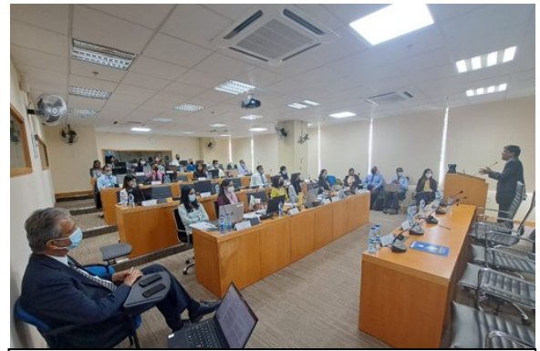
Induction Training Workshop on Public Financial Management and the Macro Dimensions of Climate

Mauritius: AFS and ATI collaborated with Mauritian government officials to deliver an induction training workshop for twenty-five newly recruited economists and senior analysts of the Ministry of Finance, Planning and Development. The workshop introduced participants to the broad scope of work covered under PFM and the macro dimensions of climate change. The workshop learning gains were evaluated through pre and post course quiz results and was well received by the participants.