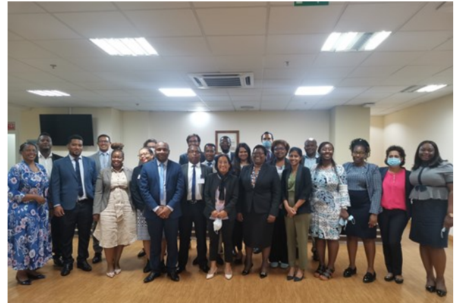
Participants in the Course on Central Bank Digital Currencies

ICD Course on Central Bank Digital Currencies (CBDCs): AFS funded an ICD-led first in-person course on CBDCs. The course included a selection of core topics on CBDC design and features and the role of CBDCs. It presented benefits, costs, and risks from the issuance of a CBDC related to monetary policy transmission, financial inclusion, financial integrity, and financial stability. It also discussed regulatory issues and international considerations. The course gave participants a foundation in central bank digital currencies and assessed the business case for CBDC adoption from the perspective of users and central banks.