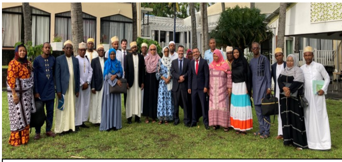
CD mission in Comoros on Fiscal Risk Management

Comoros: A joint in-person CD mission from FAD/AFS provided support to strengthen fiscal risk management and provided guidelines for a new legal and institutional framework to oversee SOEs. It also provided training on SOE-Health Check Tool developed by FAD.