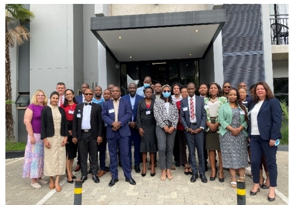
Participants in the Workshop on Analytical skills for National Accounts

Regional workshop on Analytical skills for National Accounts: The workshop, attended by 23 participants from 12 AFS countries, provided an understanding of the fundamental analytical skills required to compile and disseminate GDP estimates. The workshop was aligned with the Data Quality Assessment Framework for National Accounts Statistics produced by the IMF. The workshop was a combination of group discussions and exercises with lectures introducing each session. Participants contributed during the workshop by sharing country experiences.