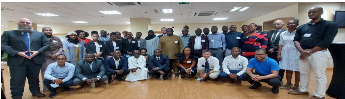
Participants in the workshop on Long Term Fiscal Sustainability and Climate Related Fiscal Risks

AFRITAC East (AFE) provided in-person training to 33 participants from 27 countries on the preparation of long-term macro-fiscal scenarios under different climate change profiles and the management of fiscal risks related to climate change. The workshop provided training on the preparation of long-term (50 year) macro-fiscal baselines, and the assessment of the impact of rising temperatures on those baselines.